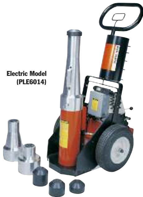
Electric Model (PLE6014)