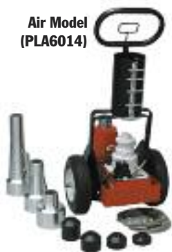
Air Model (PLA6014)