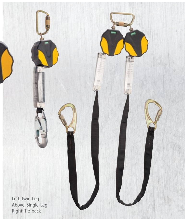
Left: Twin-Leg Above: Single-Leg Right: Tie-back