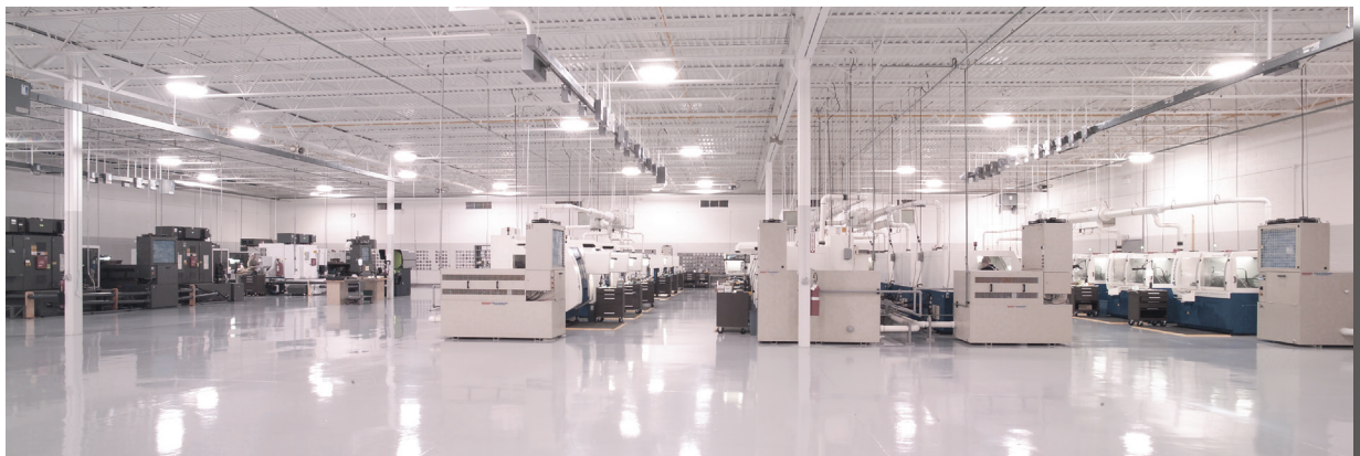
Drill and Reamer Manufacturing